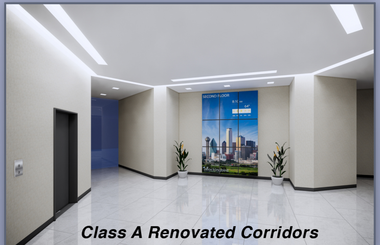
Class A Renovated Corridors