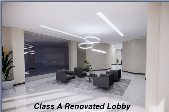
Class A Renovated Lobby